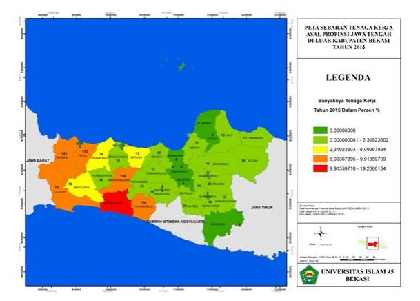
Figure 3. Workers from Central Java Province

Ease of accessibility allows residents to travel, a means of transportation that connects Central Java, West Java and even DKI Jakarta makes it easy to travel to find work, especially in the Bekasi area. The support of families who had previously lived in the Bekasi Regency increased motivation to leave their hometown.