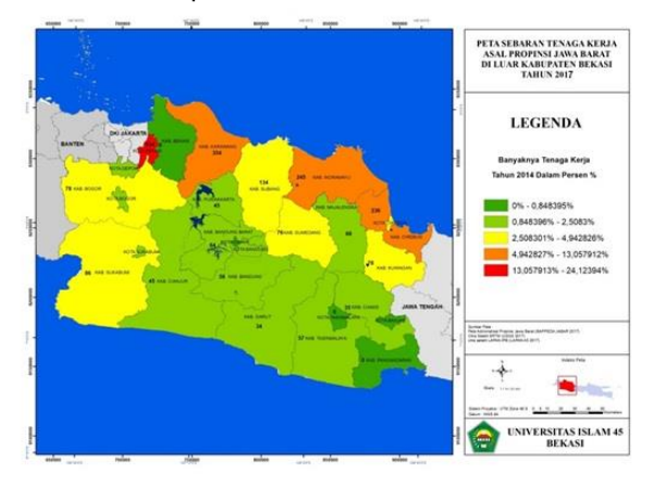
Figure 2 . Distribution of Workers from West Java Province

As seen in Figure 1, the workforce comes from the dominant West Java province, then Central Java and DKI Jakarta. While the provinces of Lampung, East Java, and Yogyakarta are smaller in number. Workers from Bekasi Regency are still dominant when compared to other districts in the province of West Java.