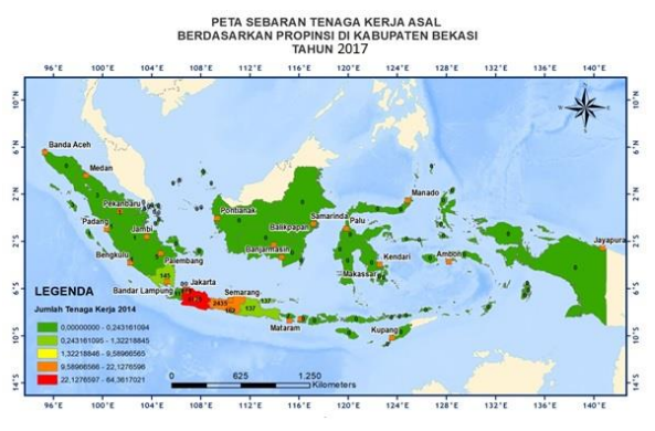
Figure 1. Distribution of Labor by Province

because the opportunities are more open than in the area of origin, wages are relatively more significant compared to working in the area of origin, as well as the level of education. From the data obtained (Figure 1) shows that labor originating from the area of West Java Province still dominates, then followed by workers coming from Central Java Province. In addition to the factors mentioned earlier, a distance factor is also an option especially for workers who come from West Java Province. What's more with the increasingly connected toll road. Make it easy for workers to return to their hometown at any time according to holidays.