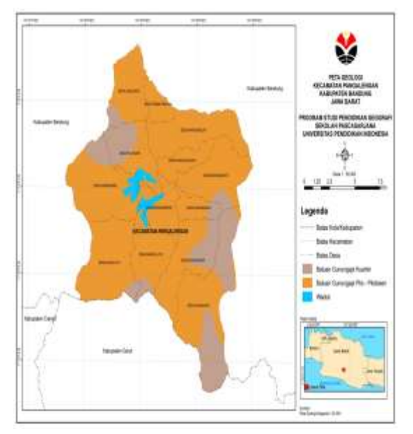
Figure 2. Regional Geology and Stratigraphic Map

The geological condition of the Pangalengan Subdistrict, based on the analysis of geological maps Pameungpeuk sheets (Alzwar, 1992) also geological maps of the area of South Bandung (Silitonga, 1973) the rocks that feed them are derived from the eruption/pyroclastic deposits of ancient Pangalengan volcanoes (cataclysmic). The geological structure that developed in the Pangalengan District area based on the analysis of the geological map above is seen as the direction of faults that are trending southeastnorthwest (Figure 2).