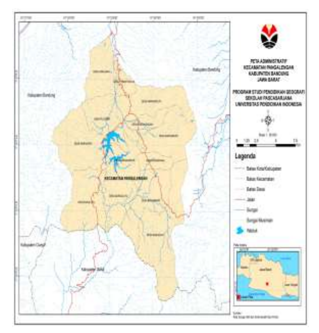
Figure 1. Administrative map of Pangalengan District

The area of Pangalengan District is 272.95 Km or 27,294.77 Ha. This area is divided into several categories, including 961.86 Ha of paddy farmland, 22,692.48 Ha of non-paddy agricultural land, and 3,640.45 Ha of non-farm land. The climate in Pangalengan Subdistrict located in the highlands or mountains makes the air temperature in this district guite cool, ranging from 16 0 Celsius - 25 0 Celsius. In 2015 rainfall was 1,996 mm/year with an average of 5.47 mm/day. The highest rainfall recorded was 11.61 mm/day occurred in February, the lowest rainfall in July was recorded at 0.34 mm/day and the highest rainy day in February and the lowest rainy day occurred in July. The administrative boundaries of Pangalengan District are 1) Northside: Cimaung District 2) Southside: Talegong District 3) and Bungbulang District 4) Eastside: Kertasari District 4) Westside: Pasir Jambu District.