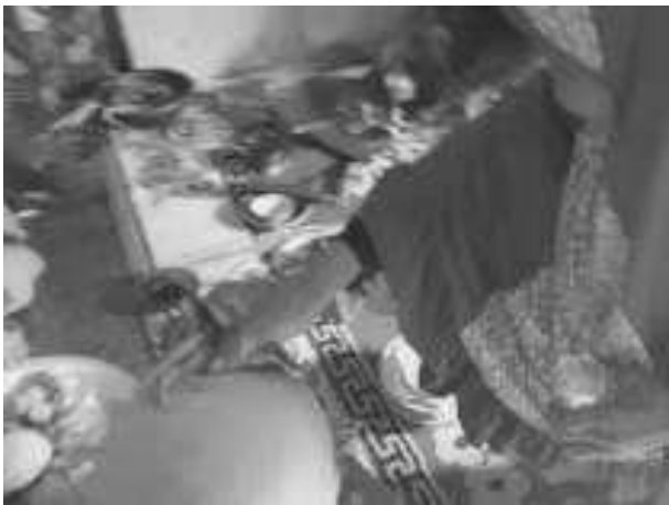
Figure 7. The process of rubbing the Holywater

The ingredients for the offerings are divided or separated into two trays. Some are stored in small trays and some are in the large one. A small tray contains: a small plate of sticky rice, one chicken breast (can be male or female), one fried banana, cucur cake, and a glass of water filled