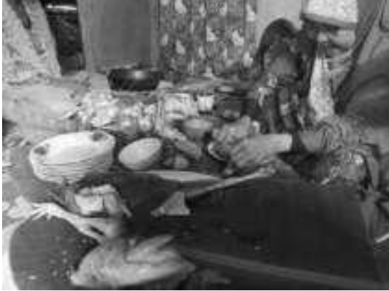
Figure 6. The process of Nosemparaka Manu (Chopping the Chicken's Body)

Chopping the parts of chicken's body was not done arbitrarily. There are provisions that applied, namely if the right thigh of a rooster is separated, then the hen's left thigh hens should be separated and vice versa. The chicken breasts are separated and placed in a tray. In addition, only the intestines were taken, then stored in coconut shells. After that, the boiled banana skin was wrapped by banana leaves. For more details, see Figure 6.