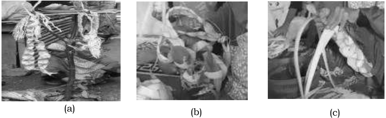
Figure 3. Suempela (a), Ojonurate (b), and Tangkarate (c)

Ojonurate is the result of woven in such a way and is seen as stairs inside the house. Both Tangkarate and Ojonurate, each of them should be 3 pieces. As a complement, Tangkarate is decorated with leaves and flowers. In addition, the Suempela tool is needed, which is a tool used to store and hang offerings.