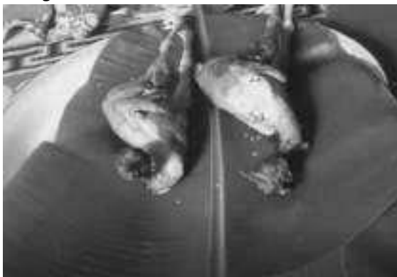
Figure 4. A Pair of Chickens (Male and Female)

The Nosemparaka Manu procession begins with the process of slaughtering a chicken. Before the chicken is slaughtered, the leader of community read the prayer. Then, the chicken is brought by the baby's father to the river to clean its fur. After cleaning the chicken feathers, the chicken is brought back to the house. Arriving at home, the chicken was grilled or grilled (not until cooked) and placed on the tray (for more details, see figure 4).