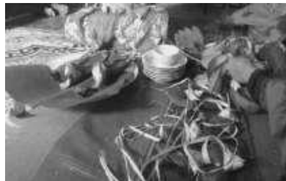
Figure 5. Offerings