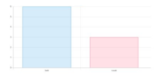
FIGURE 4. Seal Condition Graph Widget

The seal graph widget displays the condition of each seal, divided into two conditions, namely the condition of the good seal and the condition of the damaged seal. In good seal condition, it is determined based on seal in connected condition. Meanwhile, in the case of a damaged seal, it is based on an indication of a breach in the seal, in the form of breaking the seal. In the graph, it can also be seen the number of TMWE and seals that can be detected according to the respective locations of the smart seals and TMWE.