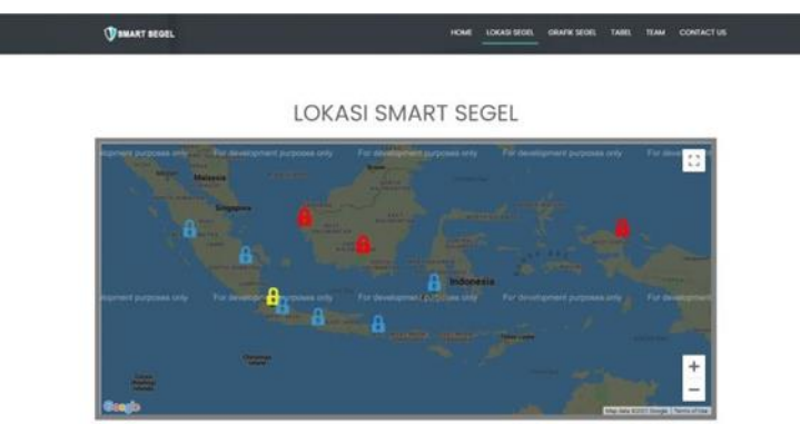
FIGURE 3. Smart Seal Location

In the web service that has been created, there are special pages for admins, interpreters and pages for users. The page display for the user is divided into 6 widgets, including home, seal location, seal graph, table, team and contact us. Each of these pages has its own function. The user who accesses the web service to be able to monitor the condition and location of the smart seal must log in by registering and registering first to be able to do or get login access as a user.