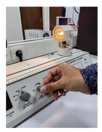
FIGURE 4. Light Intensity Regulator

The third step is to turn on the light source so that the metal in the chamber receives light on the metal in the chamber. The amount of light intensity on the light source is set to medium intensity by slowly turning the button to the right.