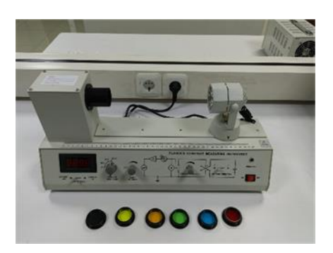
FIGURE 1. Photoelectric Effect Experiment Set

In the photoelectric effect experiment, an experiment was conducted to see the comparison of the current generated by the photoelectric effect event with the variable distance of the light source. The experiment used a photoelectric effect experiment set with specifications 12v/35 w halogen tungsten lamp; 15v output; +-0.2% accuracy; -10o C to 60o C relative humidity storage; 0o C to 50o C operating temperature; 220 V power requirement; 0.5 A fuse rating; power cord with plug 3; red, blue, green, yellow 1, and yellow 2 light filters, FIGURE 1.